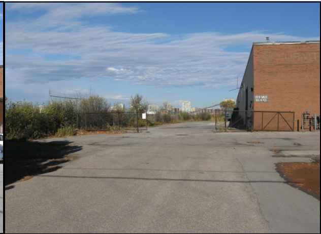
GATED OUTSIDE STORAGE